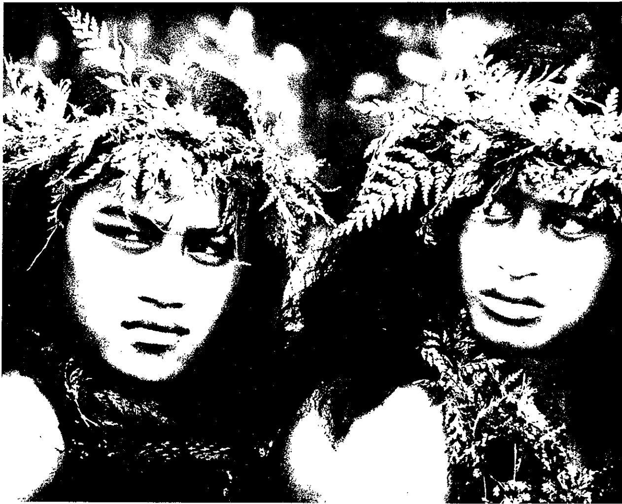
Dancers of Nā 'Ohana 'o Kealoha observing the 140th birthday of Queen Lili'uokalani in Honolulu in 1978.

tertained the past genealogical exploits of the movers and shakers of Hawaiian society with the current audience. 5 The hula held the attention of its viewer so as to bring about mutual and involved pleasure and enjoyment in life. And often the story explicated the complex and sacred sexual desires and practices of the Natives. The message instructed, entertained and was part of the cultural rhythm of daily and seasonal life. But it was also fun and amusing. Thus, for my people, the hula carried the dramatic message of life: human affairs and their surroundings and the intimate, reciprocal relationship between the two.