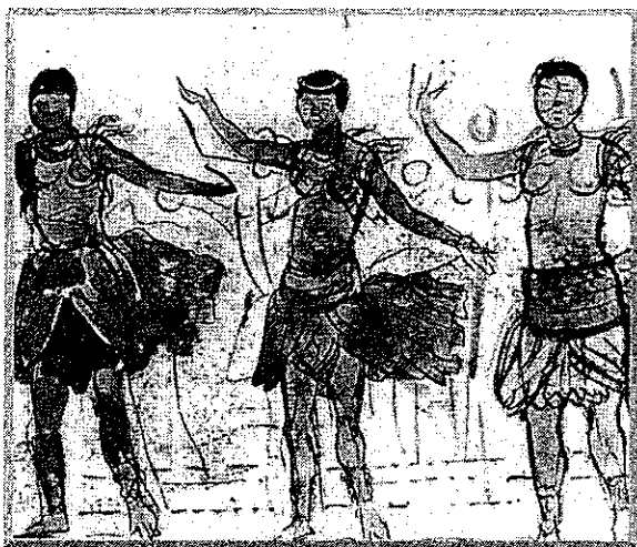
An early impression of hula, by Louis Choris, 1816 hula ku'i which embraced old and new dance steps as one. 6 This Hawaiian dance form refused to be crushed by American colonialism's oppressive values and customs.

Nineteenth-century Hawaiian practitioners of the hula were taught that this dance form was a "savage," lewd Polynesian institution that appealed to their baser instincts and exhibited a corrupting influence on their thinking and behavior. Formerly depicted as