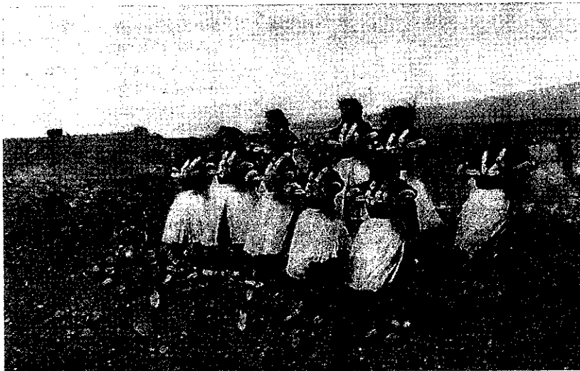
The author with her Hālau Hula dance school, Pua ali'i Ilima at Volcano National Park.

The purpose of Americanization was not to acculturate or assimilate (famous anthropological terms), but to annihilate. The annihilation was aimed at the Natives' beliefs in their names, language, environment, heritage of struggle, unity (as a people) and ultimately,