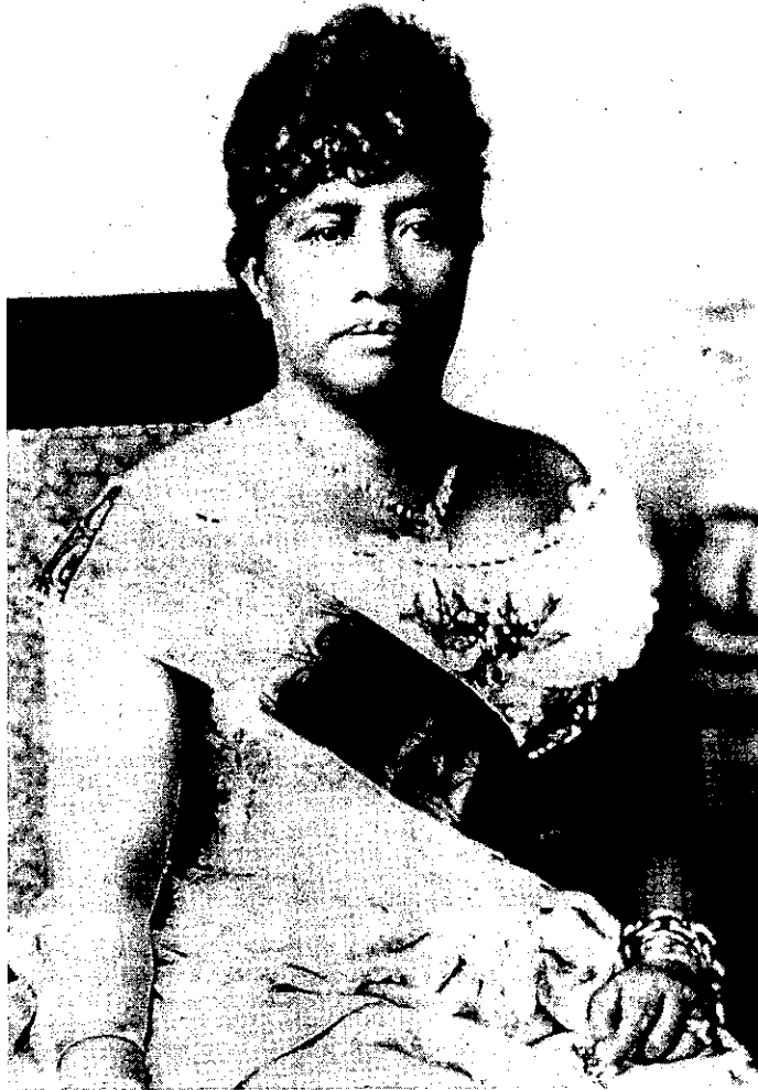
In 1893 Queen Lili'uokalani was overthrown by armed U.S. marines, ending Hawaiian national sovereignty and subjecting Native Hawaiians to haole rule.

in themselves. Americanization brought death, disease, de-population and carried off Hawaiians before they had the time or the psychological will to adapt to their radically changed environment; the haole dance of annihilation went on and on and on.